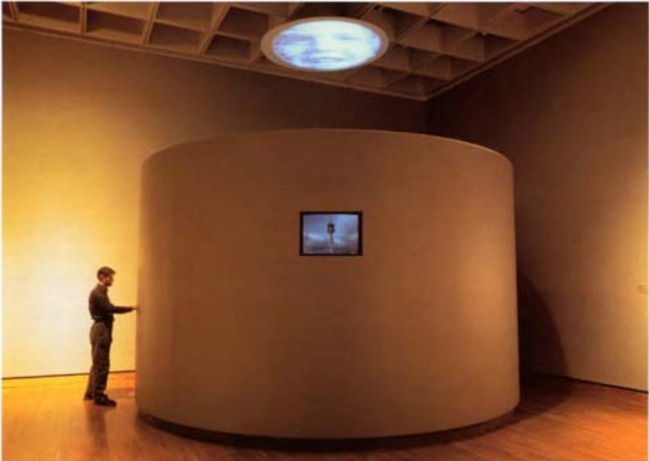
TransmissionS: In the WELL